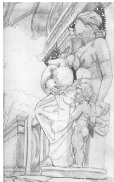
In fact here is a submission from Ellen Paullino.

If you are going to submit material via e-mail, send it to: _WilliamK @excite.com